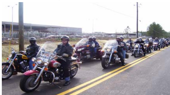
Riders Stage at the start of the Courtney Gale Ride